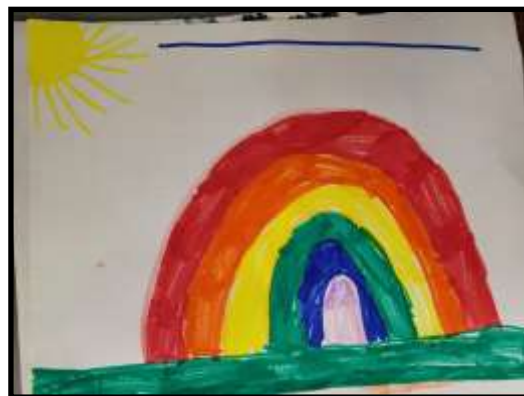
Artwork-Smith Memorial Daycare Kids

Thank you for all the beautiful altar flowers from gardens this summer!