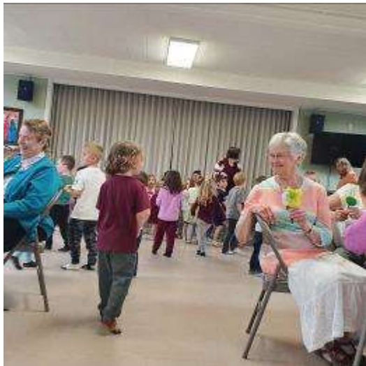
Special handmade flowers given to each honoree