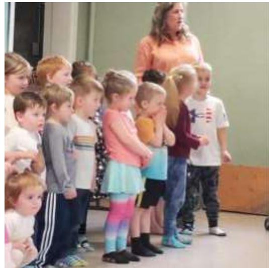
Sunshine luncheon performance from 40 Smith Memorial kids