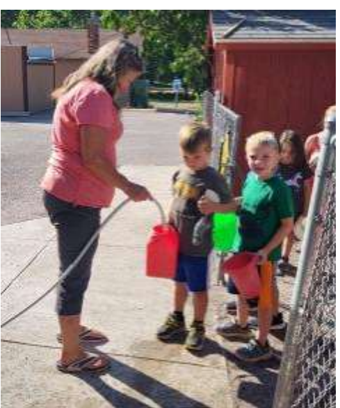
Dinosaur Dig Day