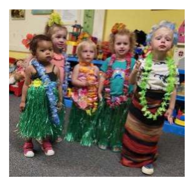
Hawaiian Day Susan's Room